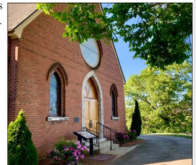
St. Matthias Episcopal Church

A new historical marker was recently installed at St. Matthias' Episcopal Church on Dundee Street. It is the latest in a series of markers in Asheville's East End neighborhood that celebrate the community's rich African American heritage.