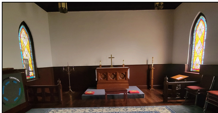
St. Matthias' newly renovated chapel

On All Saints Day, November 2, St. Matthias was excited to celebrate the baptism of a crop of children who joined the faith! They enliven our congregation!!