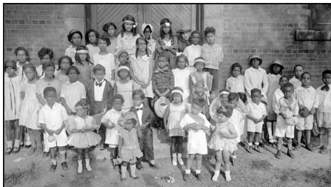
St. Matthias 1920s or 1930s