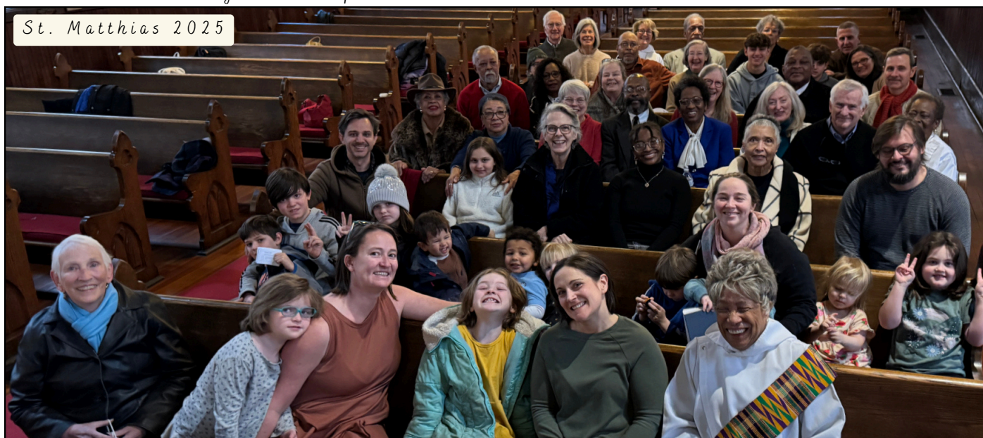
St. Matthias 2025